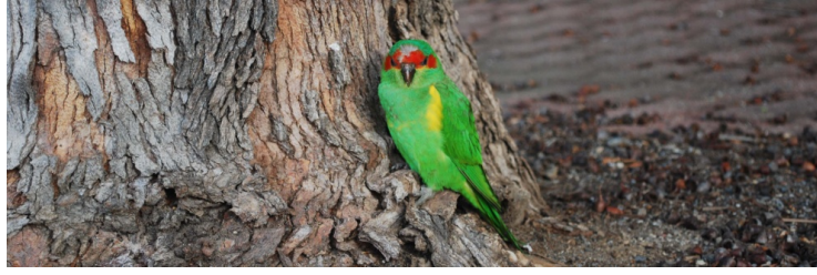
Fig. 3. A figure which spans two columns must be placed either at the top of a page or at the bottom of a page. Figure caption with more than one line must be justified. Figure caption with only one line must be centered.

A figure caption must be placed below the associated figure whereas a table caption must be placed above the associated table.