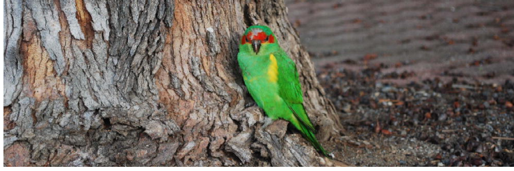
Fig. 3. A figure which spans two columns must be placed either at the top of a page or at the bottom of a page. Figure caption with more than one line must be justified. Figure caption with only one line must be centered.

A figure caption must be placed below the associated figure whereas a table caption must be placed above the associated table.