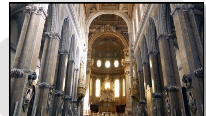
Duomo of Naples