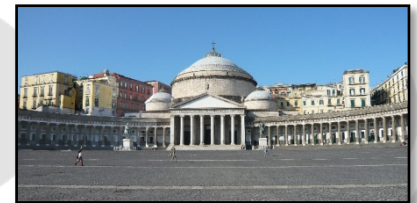
Naples, Plebiscito Square