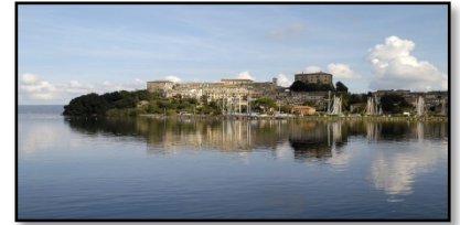
Museum of Capodimonte